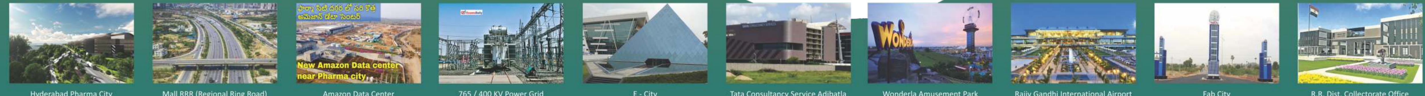
Hyderabad Pharma City